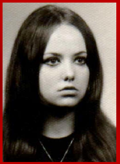
1969, Entering the Komenius University, Bratislava

standards expected by the Komenius University in Bratislava. My colleagues who interviewed me for the post of the Research Fellow at the Open University in 1989 told me that I "did not have competition". I subsequently interviewed candidates qualified as sociologists from British Universities who could not define "culture". Culture is the main object of sociological study. Culture is represented by the collective predominant patterns of behavior of an ethnicum, or group. (Not by going to the cinema, or the theatre, as the man-in-the-street and some sociology graduates may understand it.)