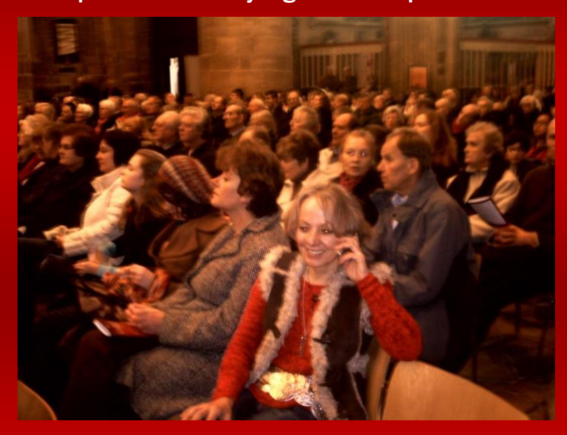
Non-conformist, intrepid freethinker and an outspoken "foreigner" – an inevitable target to exclusion from a society of sheeple in a small town of Cheltenham.

I was born in Bratislava, Slovakia, 28th February 1951, to German mother and father born in Budapest, Hungary. My mother tongue is German. I believe that international diversity is important to stability. My perspective is incompatible with monetary globalism based on exploitation and inequality, while suppressing individuality and free expression. Today's globalists speak of false equality.