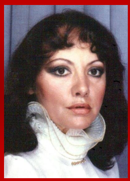
1983, First British Passport Gloucestershire

I was born in Bratislava, Slovakia, 28th February 1951, to German mother and father born in Budapest, Hungary. My mother tongue is German. I believe that international diversity is important to stability. My perspective is incompatible with monetary globalism based on exploitation and inequality, while suppressing individuality and free expression. Today's globalists speak of false equality.