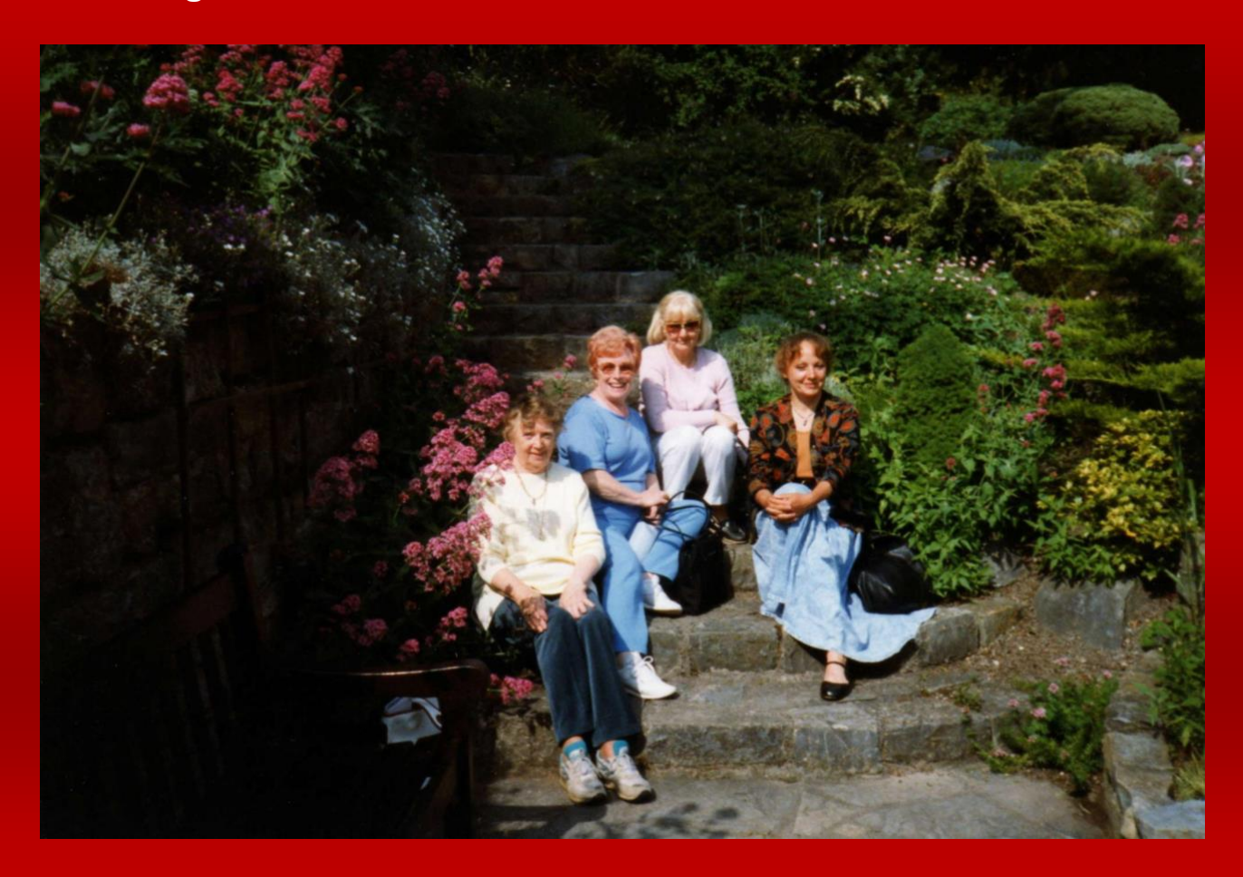
1998, On a healing retreat with friends

When the doors to further academic research closed in 1996, I was guided to discover myself through spirituality. The "extraordinary" experiences throughout my life, starting in early childhood, fell into place and made sense. While the exclusion from the business World was disappointing and hurtful, I soon felt happier than before, through the new door just opened. It was like an outer crust peeling off me to feel a more genuine self underneath.